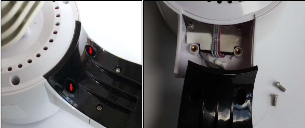
Figure 2: Screws to remove

Step 3: Turn the device upside down and remove the two screws from the black baseplate nearest the rain bucket. Gently separate the two parts. (see Figures 2 and 3)