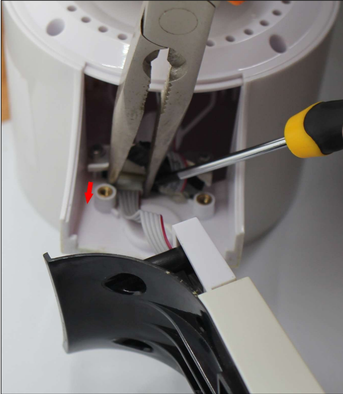
Figure 5: Removing the connecting plug

Step 5: Use long-nose pliers to grip the plug and gently pull it out parallel to the base, in the direction of the lie of the cable. It should slide out easily, requiring little force. (See Figure 5).