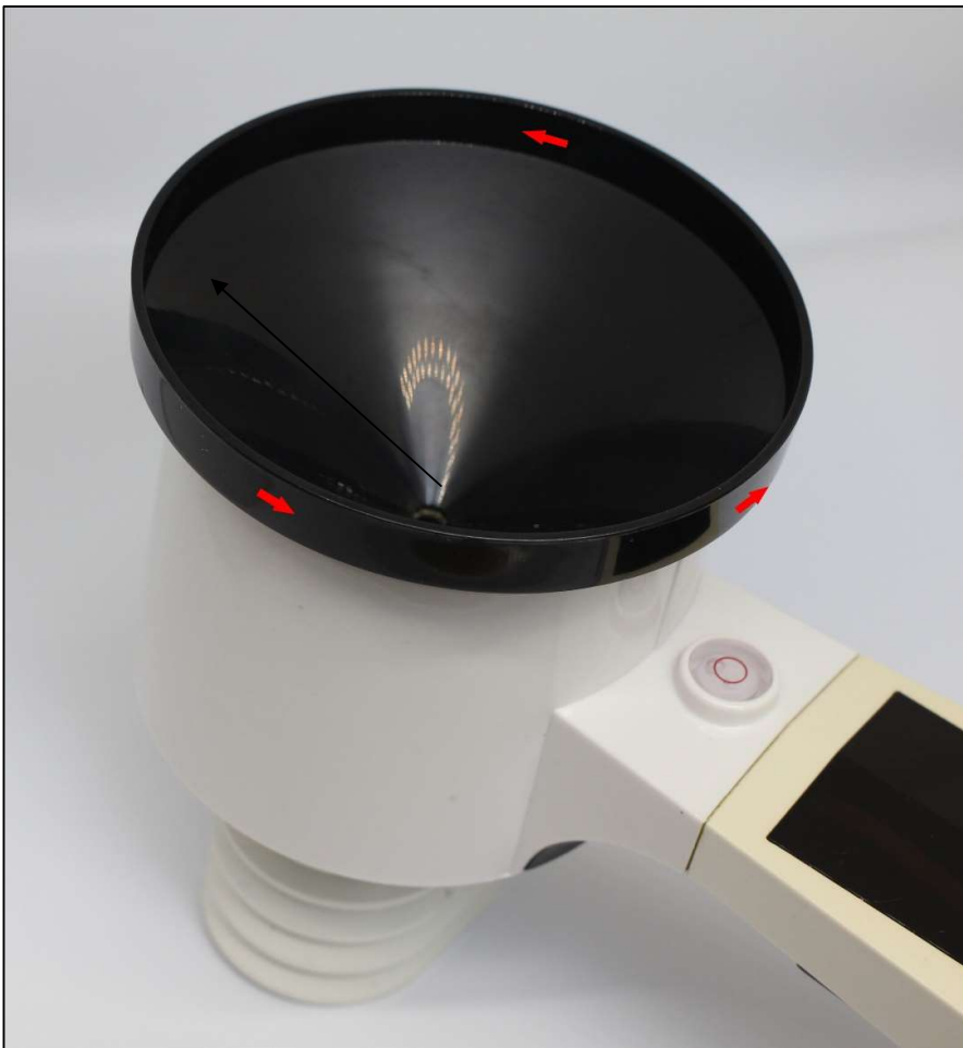
Figure 1: Removing the rain funnel